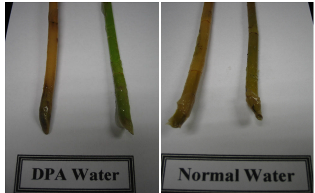
DPA Water Day 46: A section of the stem remained green

Immersing plants in DPA treated water can improve the hydration process and keep them better hydrated. In the same study, it was shown that after 46 days, the orchids in DPA treated water were in better condition than those in normal water. For orchids immersed in DPA treated water, a section of the stem still remained green and lush. In stark contrast, the stems of orchids in normal water turned brown totally.