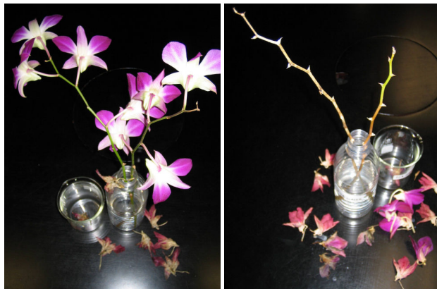
DPA Water Day 31: 8 petals remaining